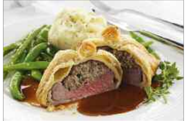
F 34211 Brakes Beef Wellington – Beef fillet topped with chicken liver & bacon pâté wrapped in puff pastry. 1 x 8 (210g)