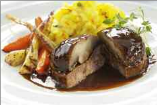
F 34212 Brakes Beef Brisket with Portobello Mushroom & Balsamic Jus – Cooked beef brisket steak with a roasted portobello mushroom in a glossy balsamic jus. – 1 x 8 (385g)