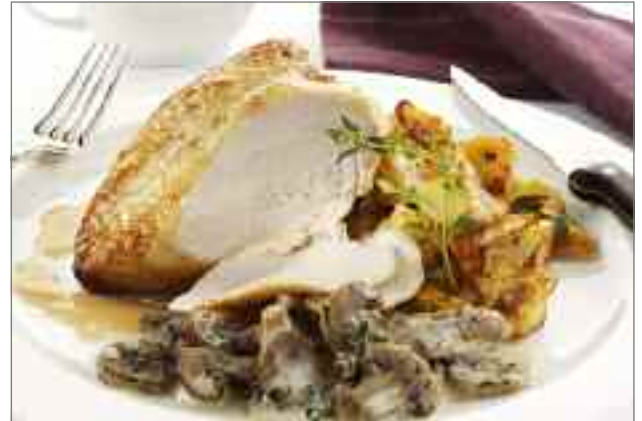
F 34281 Brakes Roast Chicken Saddles – Cooked, skin on, bone in chicken saddle (with added dextrose). 1 x 8 (225g-315g)