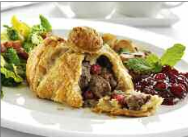
F 34257 Brakes Lamb en Croûte – Slow cooked lamb pieces in rich redcurrant, mushroom & red wine sauce wrapped in puff pastry. – 1 x 10 (215g)