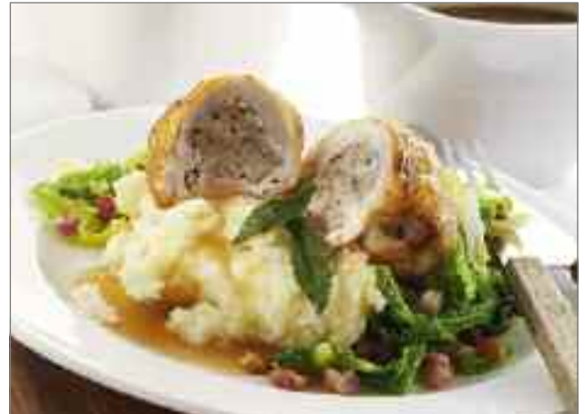
F 34280 Brakes British Stuffed Chicken Thighs Red Tractor Farm Assured boneless chicken thighs stuffed with turkey, onion & sage. – 1 x 20 (156g)