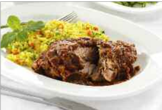
F 34213 Brakes Allspice Lamb Shoulder Fully cooked bone in lamb shoulder in a tomato & allspice sauce. – 1 x 8 (385g)